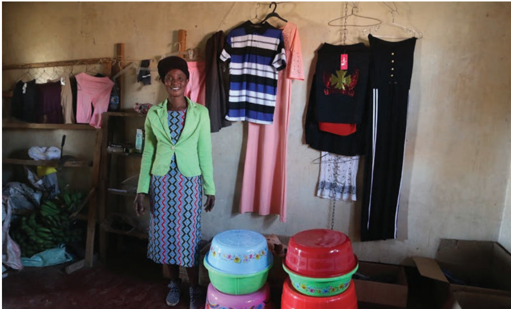
Beneficiary standing with some of the retail items she purchased with funds from the First Fruits Program